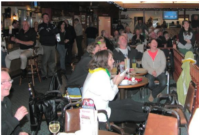
The Club is packed on Superbowl Sunday February 6, 2011